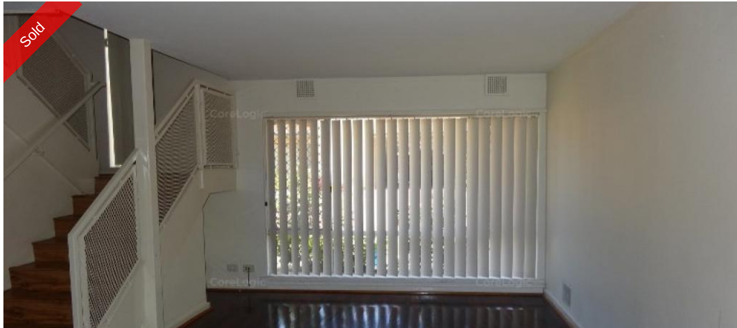
Unit 2, 69 Tendring Way, Girrawheen